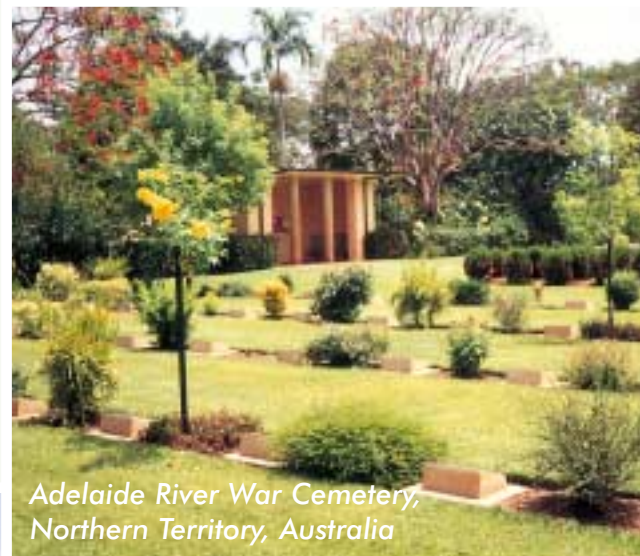
Adelaide River War Cemetery, Northern Territory, Australia

The main component of the Army was the militia Citizen Military Force (CMF), retained for home defence, with the 2nd Australian Imperial Force (AIF) formed for service overseas. In 1941 its 6th Division fought in Libya and Greece, the 9th and part of the 7th at Tobruk, Libya, and the 7th in Syria. Units were recalled in 1942 to defend Australia but the 9th Division stayed and fought at El Alamein.