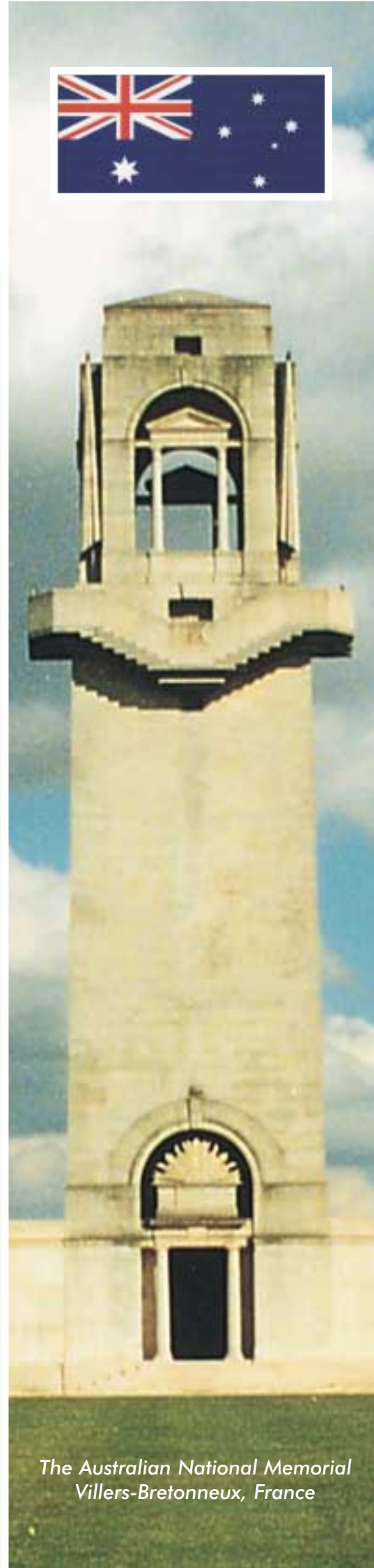
The Australian National Memorial Villers-Bretonneux, France

Soon, the Royal Australian Navy and the Australian Imperial Force (AIF) were committed to the war in Europe. The first contingent of 20,000 sailed in October 1914 and the cruiser HMAS Sydney sunk the German raider Emden in the Indian Ocean in November 1914 while escorting the convoy. For much of the remainder of the war, ships of the Royal Australian Navy were deployed on convoy escort and anti-submarine duties, and in the blockade of Germany.